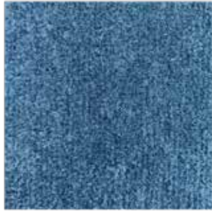
Pale Shadow Blue