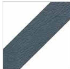
Pale Shadow Blue