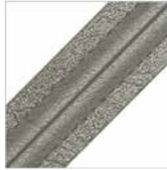
Old Grey (Antiqued)