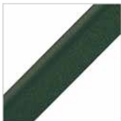
Apple Green (Antiqued)