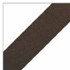
Dark Brown (Antiqued)