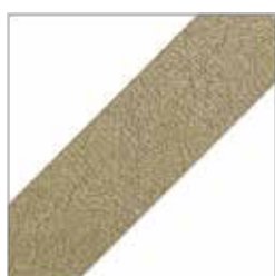
Old Beige (Antiqued)