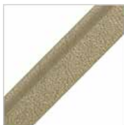
Old Beige (Antiqued)