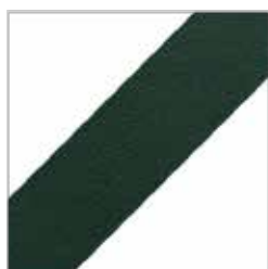
British Racing Green