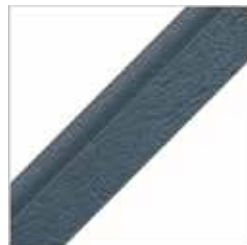
Pale Shadow Blue