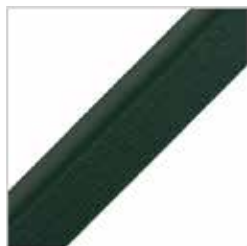
British Racing Green