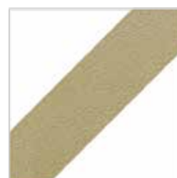
Light Stone Beige