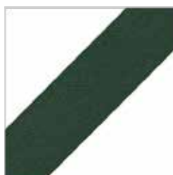
Apple Green (Antiqued)