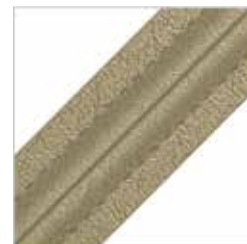
Old Beige (Antiqued)