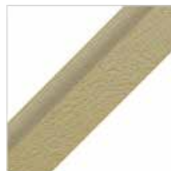
Light Stone Beige