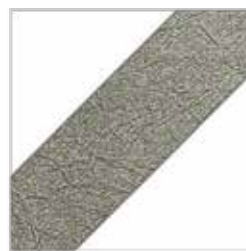
Old Grey (Antiqued)