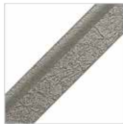
Old Grey (Antiqued)