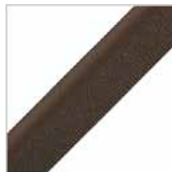
Dark Brown (Antiqued)