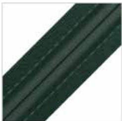
British Racing Green