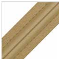
Biscuit Light Tan