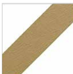
Biscuit Light Tan