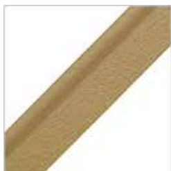
Biscuit Light Tan