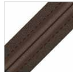
Dark Brown (Antiqued)