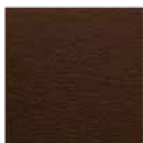
Chestnut (RG 1290)