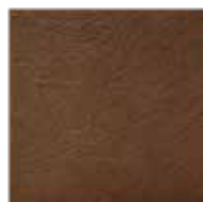
Beige (RG 1290)