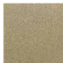
Old Beige (Antiqued)