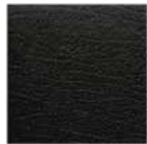
Black (RG 1290)