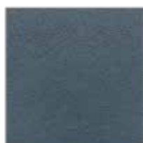
Pale Shadow Blue