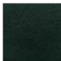
Dark Jaguar Green