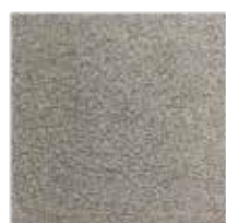
Old Grey (Antiqued)