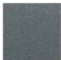
French Blue (Antiqued)