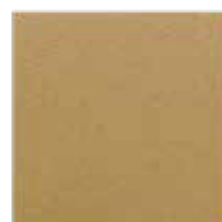
Biscuit Light Tan