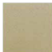
Light Stone Beige