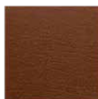
New Tan 'RG/Saddle Tan